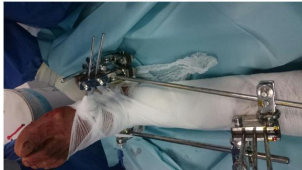
Fig. 4. Clinical image showing a Hoffman external fixator assembly