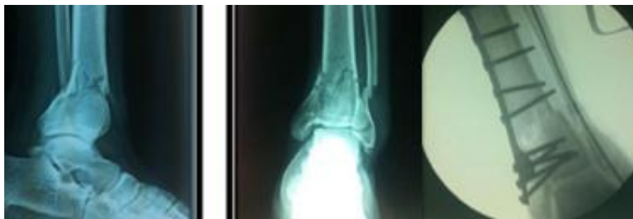
Fig. 2. (Ankle AP and lateral) a complex fracture of the tibial pilon treated with a trefoil plate with pinning of the fibula.