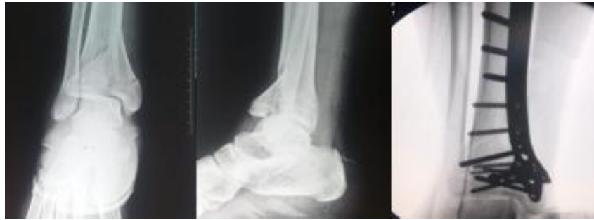
Fig. 3. A complex fracture of the tibial pilon treated with a trefoil plate