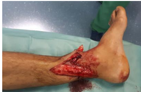
Fig. 1. Clinical image showing an open fracture of the left tibial pilon.

Clinically, we grouped 14 open fractures, or 22%; including 7 type I cases, 5 cases classified as type II, and 2 cases classified as type III.