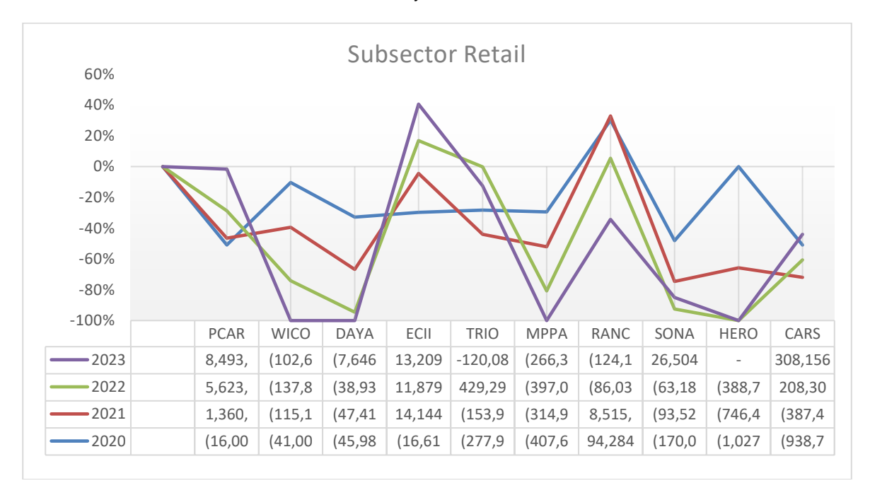
Fig. 1. Revenue decline