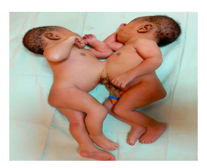
Fig. 2. Omphalopagus conjoined twins