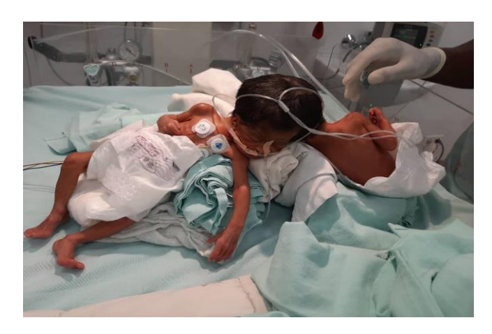
Fig. 1. Conjoined craniopagus twins

The treatment consisted of hospitalization in an intensive care unit with an open incubator, cardiorespiratory monitoring, placement of an orogastric tube and an umbilical venous catheter, age-appropriate fluid and carbohydrate intake, essential newborn care and probabilistic dual antibiotic therapy (ceftazidime 35 mg/kg/8h and gentamicin 5 mg/kg/24h). Close monitoring with psychological follow-up of the parents. The evolution was marked by the occurrence of an unrecovered cardiorespiratory arrest at H48 of hospitalization on (D1) then on (D2).